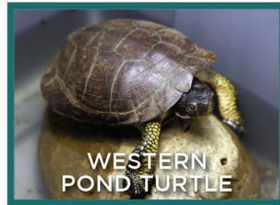
WESTERN POND TURTLE