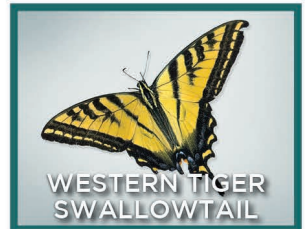
WESTERN TIGER SWALLOWTAIL